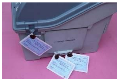
Sealing of Drop Box of VVPAT with Address Tag