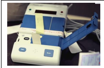
Fixing Green Paper Seal