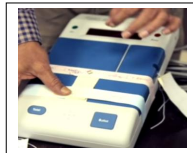
Sealing with Outer Paper Strip Seal (ABCD Seal)