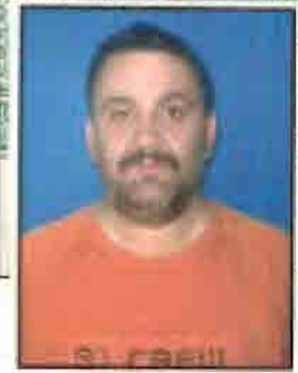
Form 2D (see Rule 4)

Affidavit to be filed by the candidate alongwith nomination paper before the Returning Officer for election to J&K Legislative Assembly (name of the House) from 74 - Bishnah constituency (Name of the constituency)